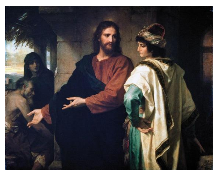
Christ and the Rich Young Ruler Hoffman 1889

412 N. Church Street, Rockford, IL 815-964-5514 www.emmanuelrockford.org