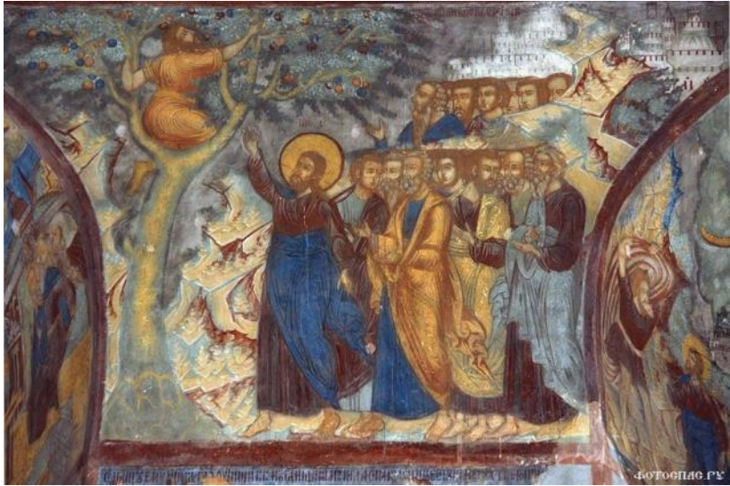
Repentant Zacchaeus. Yaroslavl. Church of the Epiphany