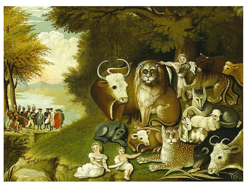
Peaceable Kingdom-Edward Hicks