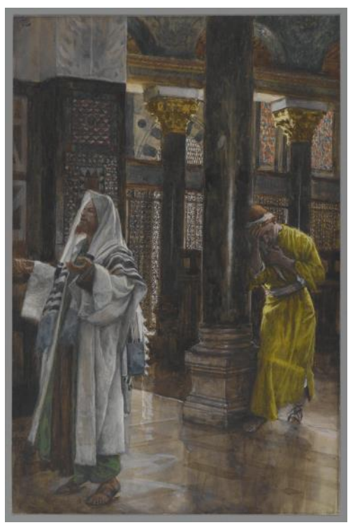
The Pharisee and the Publican James Tissot 1886-189