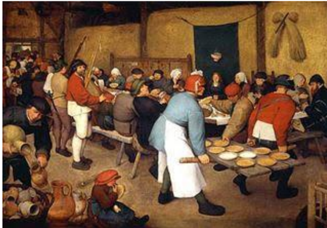
Parable of the Great Banquet