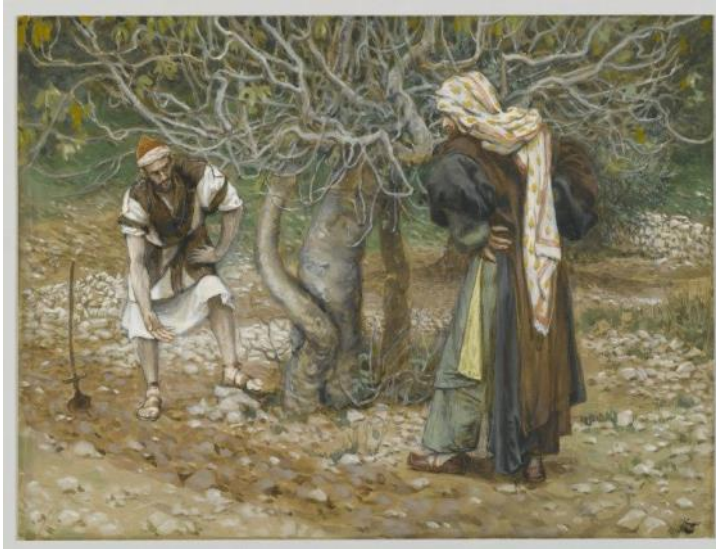
The Vine Dresser and the Fig Tree (1886-1894) James Tissot