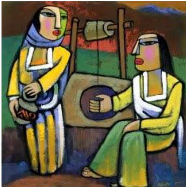
The Woman at the Well He Qi