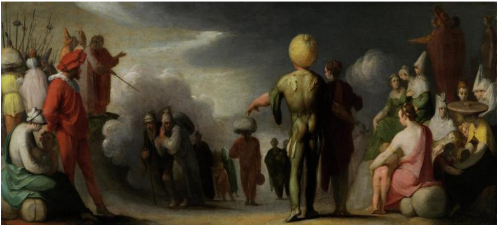
Cornelis Cornelisz. van Haarlem (1562–1638; born and died Haarlem, Netherlands) Princeton University Art Museum