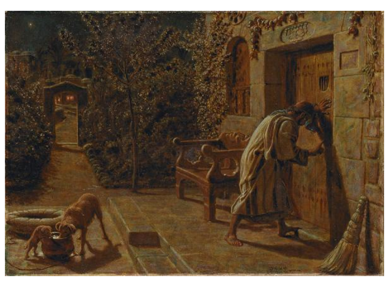
The Importunate Neighbour William Holman Hunt 1895