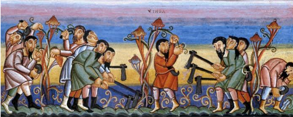
Parable of the Workers in the Vineyard [Codex aureus Epternacensis]