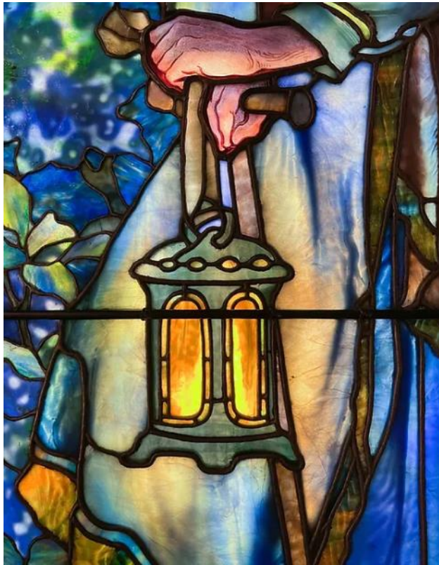
Detail of Christ and Nicodemus Tiffany Studios