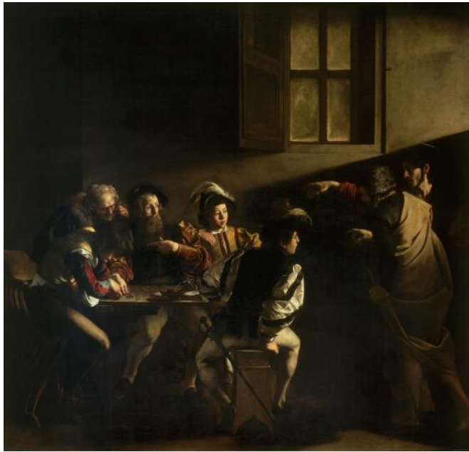
Michelangelo Merisi da Caravaggio, Calling of St. Matthew, oil on canvas, c. 1599-1600 (Contarelli Chapel, San Luigi dei Francesi, Rome)