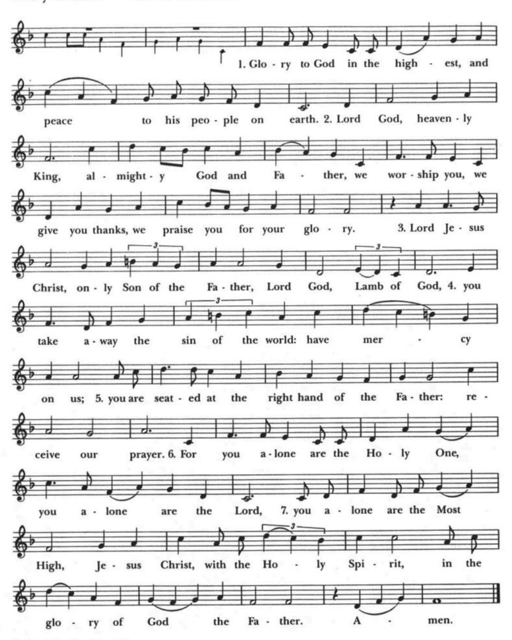
Glory to God Gloria in excelsis