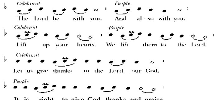
right to give God thanks and praise.

People: It is right to give God thanks and praise.