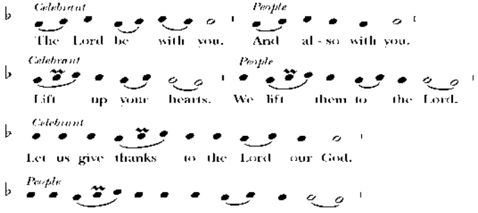
It is right to give God thanks and praise.

People: It is right to give God thanks and praise.