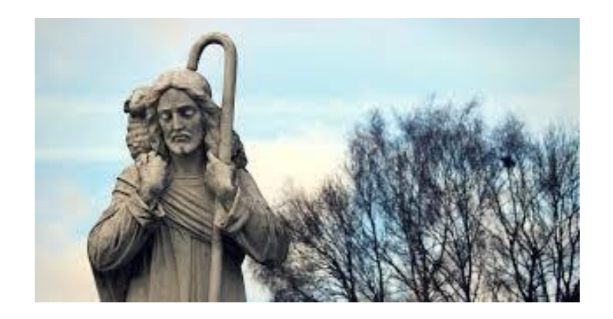
Good Shepherd Sunday April 30, 2023 8:00am & 10:30am