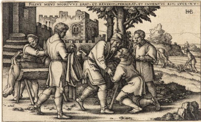
Return of the Prodigal Son between 1525 and 1550 Hans Sebald Beham