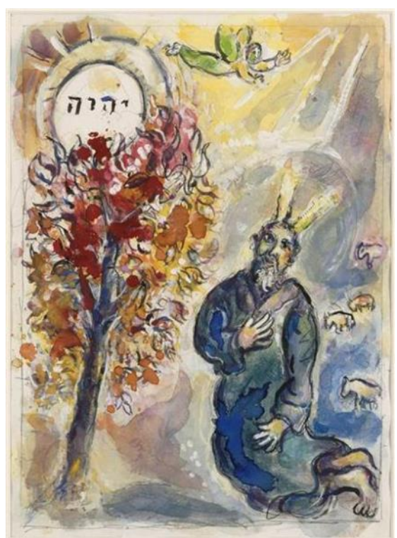
Moses and the Burning Bush, 1966