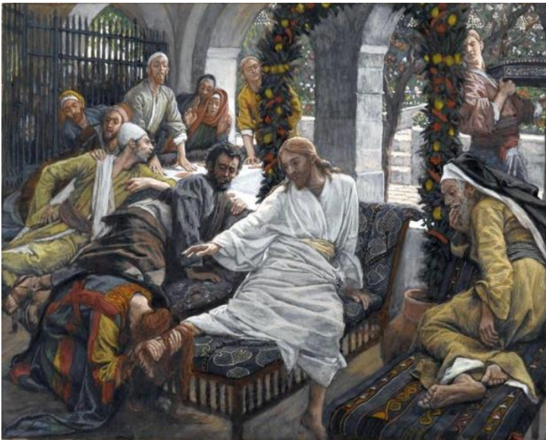
The Ointment of the Magdalene(1886-1894) James Tissot