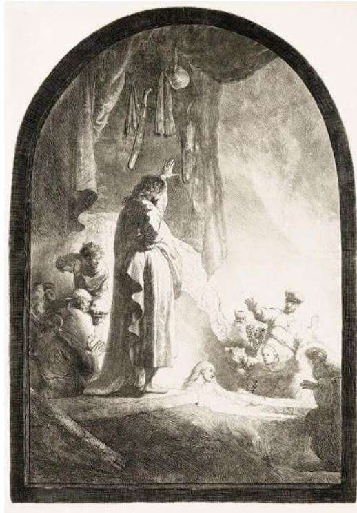
The Raising of Lazarus Rembrandt (Rembrandt van Rijn) (Dutch, Leiden 1606–1669 Amsterdam) ca. 1632