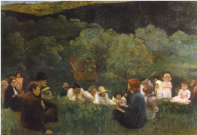
Károly Ferenczy February 8, 1862 – March 18, 1917