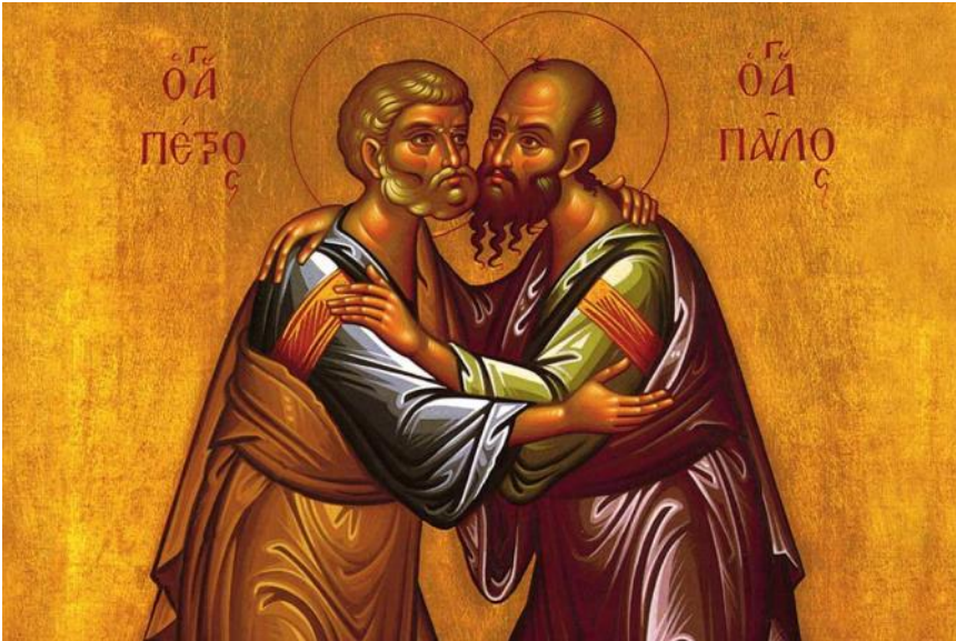
Peter and Paul embrace after their public confrontation in Antioch.