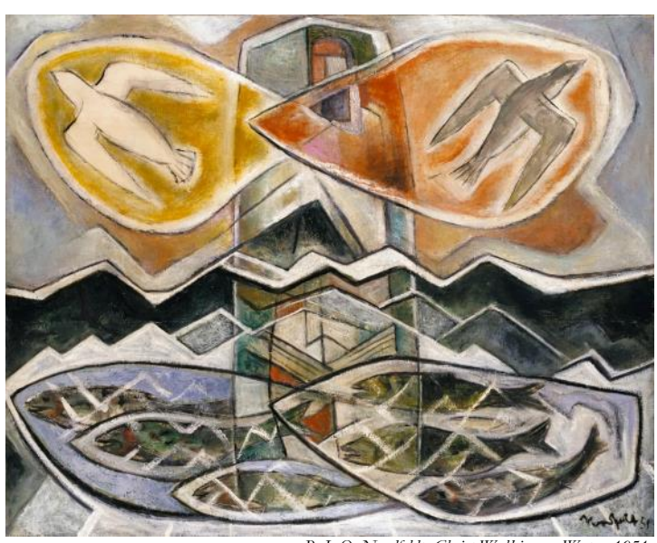
B. J. O. Nordfeldt, Christ Walking on Water, 1951, oil on canvas, Smithsonian American Art Museum