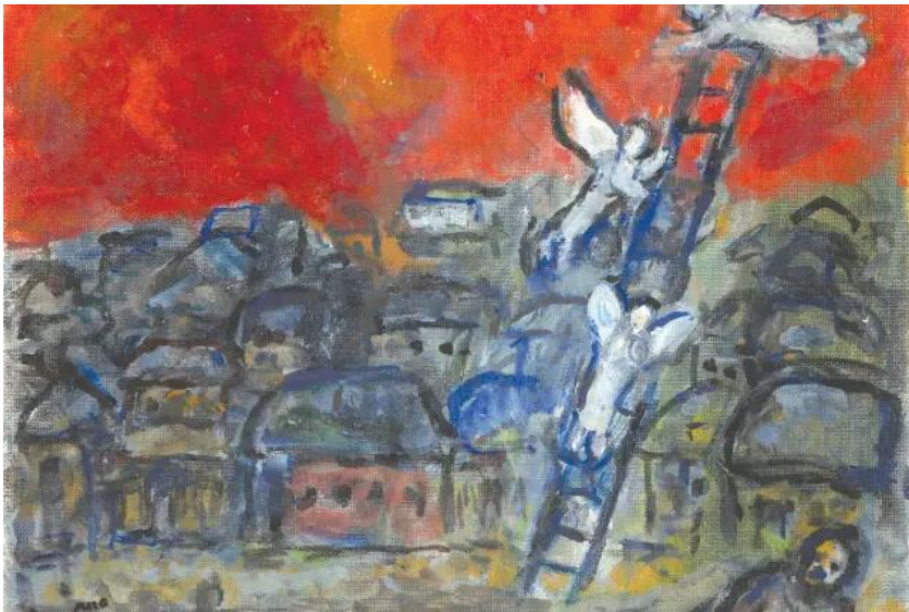
Jacob's Ladder' by Marc Chagall