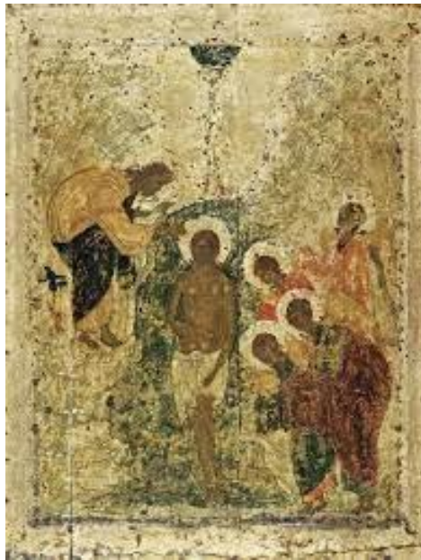
Andrei Rublev, c.1405 Cathedral of the Annunciation, Moscow, Russia