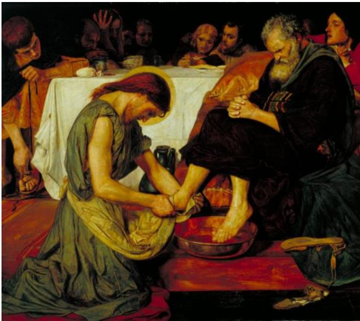
Jesus Washing Peter's Feet Ford Madox Brown 1852–6 Tate Gallery London, England