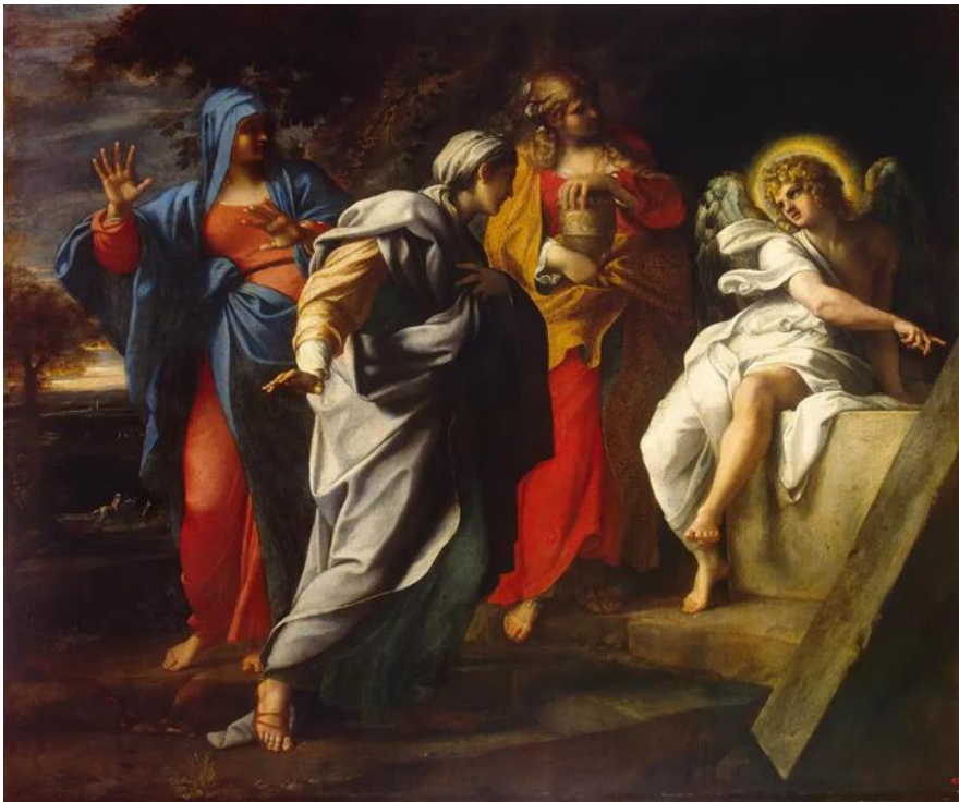
The Holy Women at Christ's Sepulchre 1598 Annibale Carracci

Easter Day April 9, 2023 8:00am & 10:30am