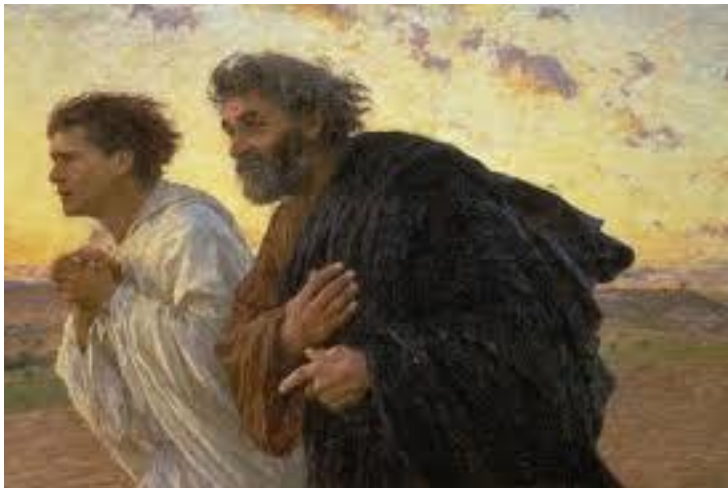
Eugène Burnand 1879

Celebrant: A lmighty God, to you all hearts are open, all desires known, and from you no secrets are hid: Cleanse the thoughts of our hearts by the inspiration of your Holy Spirit, that we may perfectly love you, and worthily magnify your holy Name; through Christ our Lord. Amen.