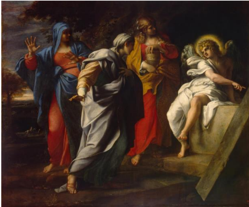
The Holy Women at Christ's Sepulchre late 1590's Annibale Carracci

Easter Day April 17, 2022 8:00am & 10:30am