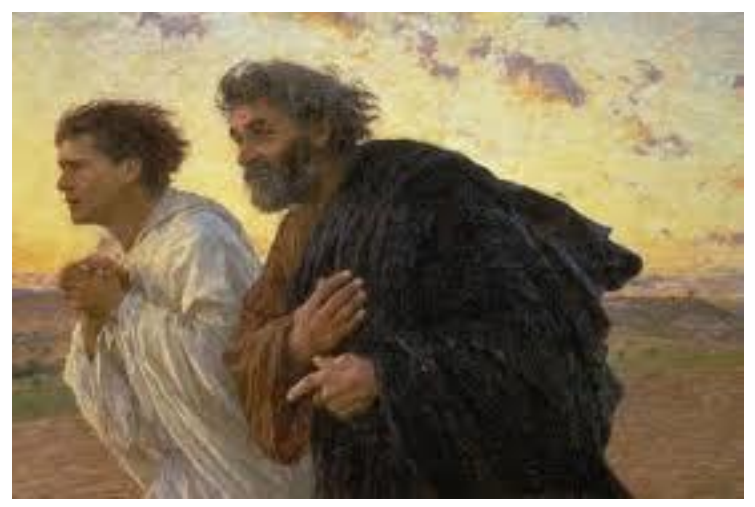
Eugène Burnand 1879

Celebrant: Almighty God, to you all hearts are open, all desires known, and from you no secrets are hid: Cleanse the thoughts of our hearts by the inspiration of your Holy Spirit, that we may perfectly love you, and worthily magnify your holy Name; through Christ our Lord. Amen.