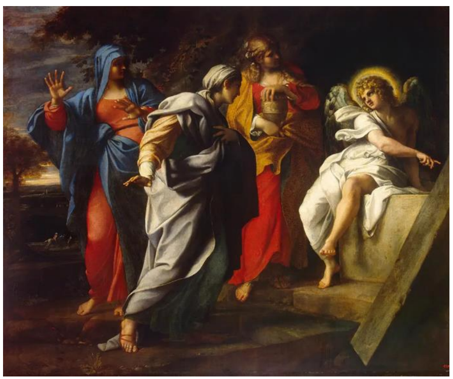
The Holy Women at Christ's Sepulchre 1598 Annibale Carracci

Easter Day March 31, 2024 8:00am & 10:30am