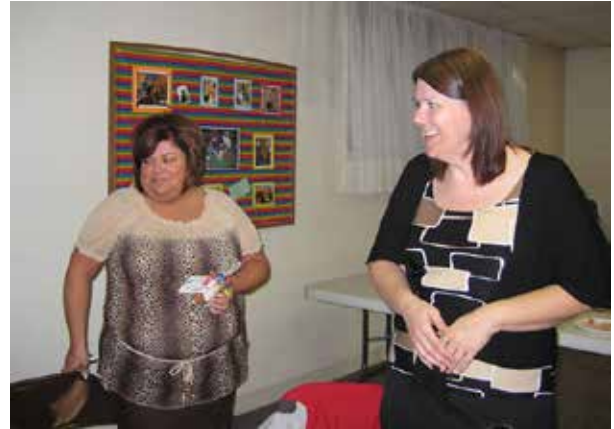
Shelter Care Ministries employees leaving the luncheon with a smile!