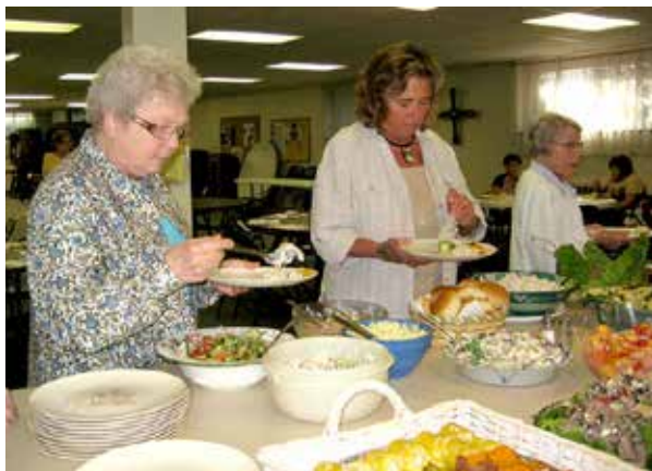
Emmanuel Guild members facing the difficult decision of which salads to choose for lunch.