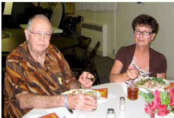
Shelter Care employees enjoying a relaxing lunch.